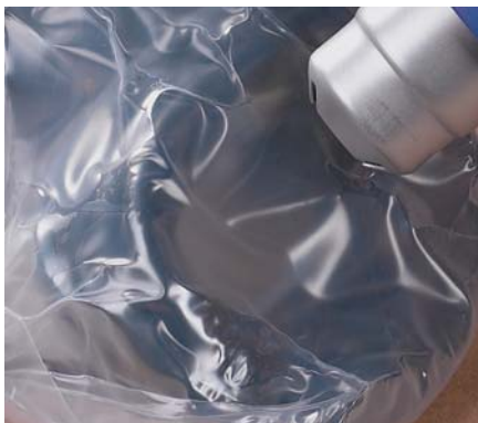
Shrinking PIC PRO PLUS