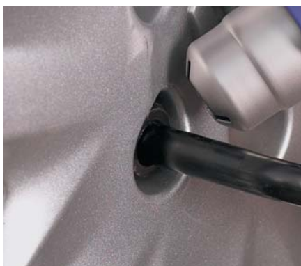
Loosening of screws PIC PRO PLUS