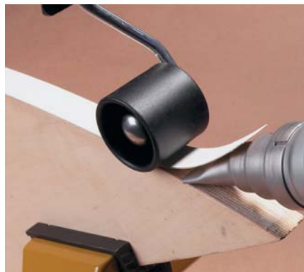
Edge banding PLUS