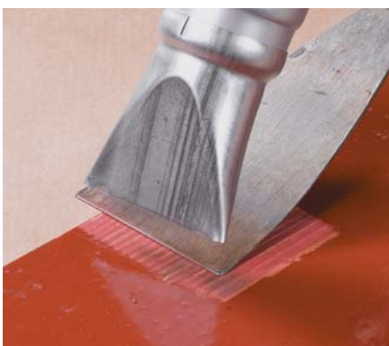
Paint stripping PIC PRO PLUS