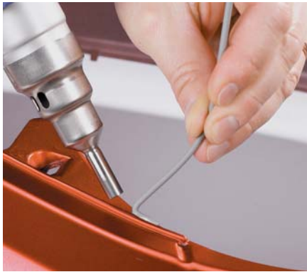
Pendulum welding PLUS