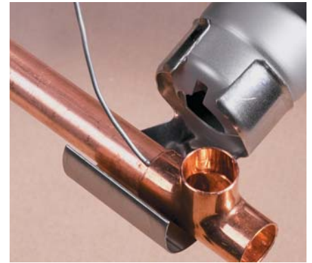
Soldering of copper tubes PRO PLUS