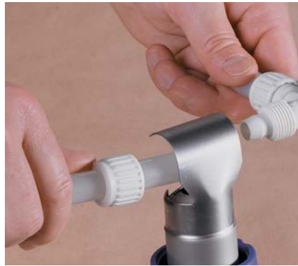
Forming PIC PRO PLUS