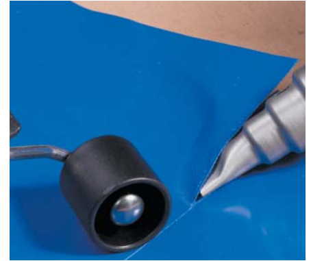
Repair welding PLUS