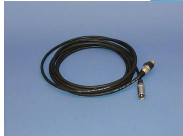
15 foot extension cord MCH-100-CX