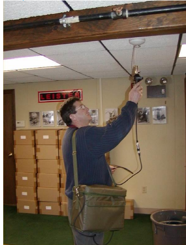
Heat Sensor Testing