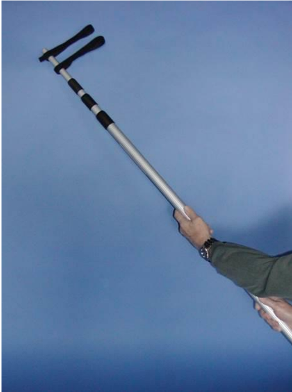
18 foot Extension Pole MCH-100-CEXT