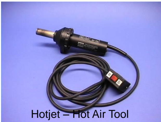
Hotjet – Hot Air Tool