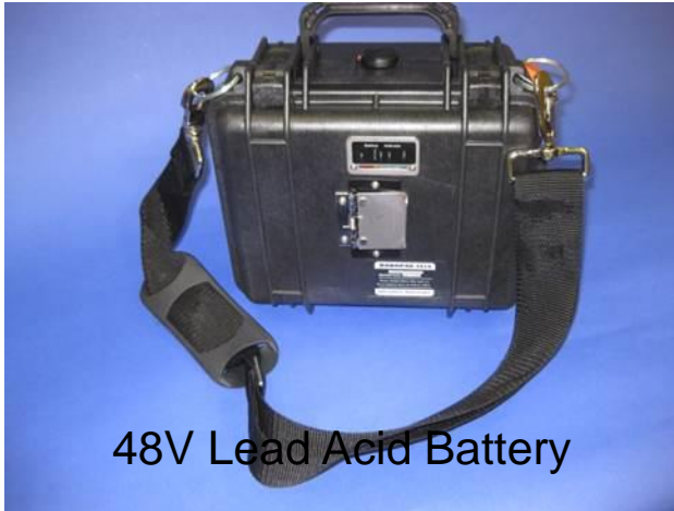
48V Lead Acid Battery