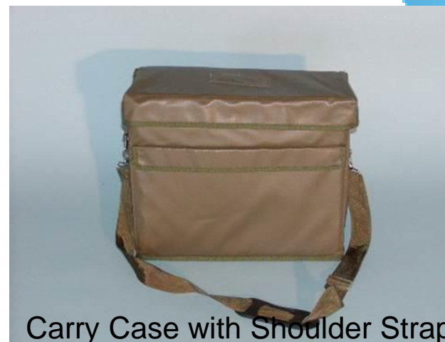
Carry Case with Shoulder Strap